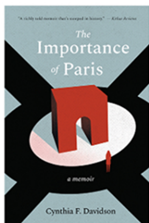
The Importance of Paris